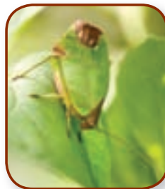
This insect looks like a leaf.

Think of another example of an animal that uses camouflage. What advantage does camouflage give to the animal?