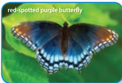
red-spotted purple butterfly