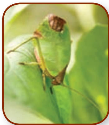
This insect looks like a leaf.

Color, patterns, and body shape are adaptations that help camouflage both predators and prey. Because a polar bear's fur looks white, for example, it can blend in with the snow. The polar bear can watch its prey without being seen, and attack when the time is right. The spots on a fawn camouflage it from predators in the light of the forest. An insect shaped like a twig is camouflaged by its shape.