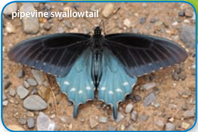
The red-spotted purple butterfly is a mimic of the poisonous pipevine swallowtail butterfly. A bird can't tell them apart, so it will not eat either one.

God designed some animals to look, sound, or behave like other animals. These other animals may have warning signals to protect them. Their colors or patterns may inform predators they are poisonous or taste horrible. The animals that imitate them are neither poisonous nor terrible-tasting. However, predators stay away anyway, because they think both are the same kind of animal. When an animal imitates another animal or object to avoid predators, it is called mimicry .