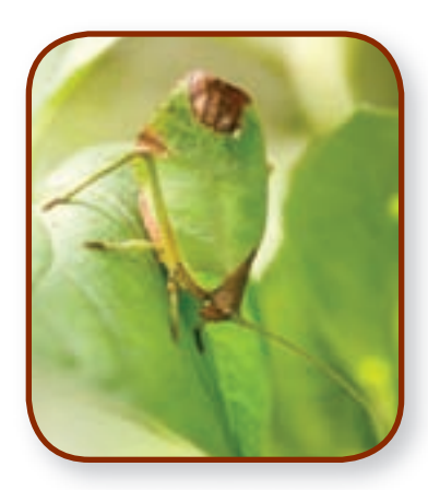
This insect looks like a leaf.

Think of another example of an animal that uses camouflage. What advantage does camouflage give to the animal?